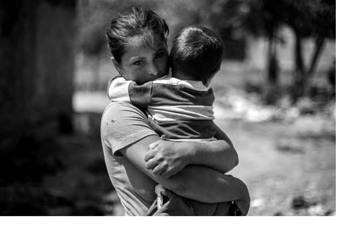
Above: Roma mother and child in Romania.

by complex private and public factors that make them particularly at risk of violence.