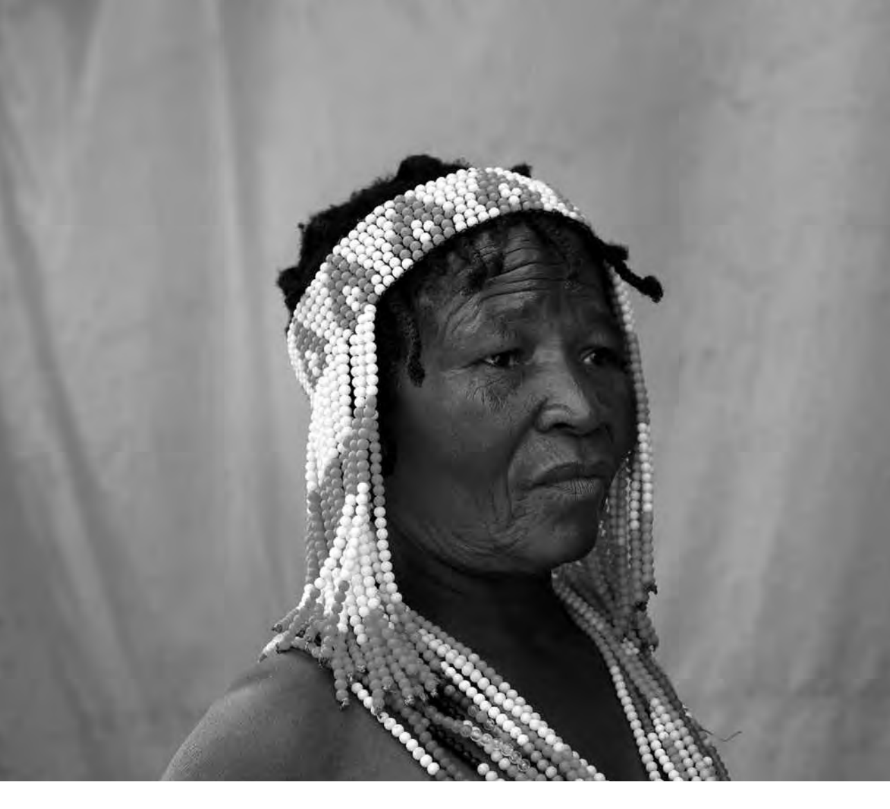
Above: San women dancers in South Africa.

veld food, which plays a vital part in providing food security, particularly to the !Kung San in this area. Ongoing drought has forced many cattle farmers to search for additional grazing areas as available grazing in communal areas has reduced dramatically. This scarcity has been amplified by local elites fencing off areas in other regions for their own purposes.