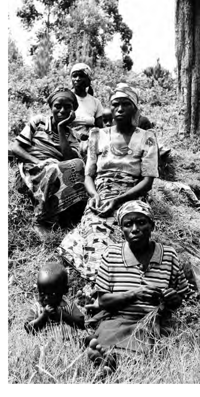
Above: Batwa women in Uganda.

With limited avenues for legal redress, Ugandan minority and indigenous communities have adopted other avenues of recourse. Batwa communities in Uganda have created drama programmes that highlight common stereotypes