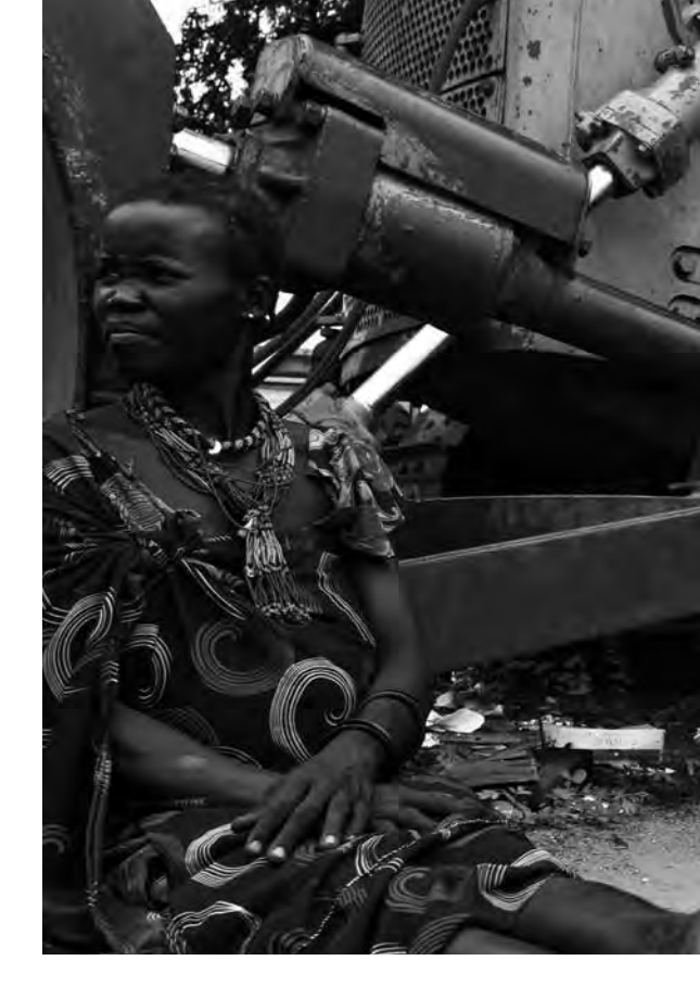
Above: Murle women sit beside an abandoned tractor near their shelter in Pibor, South Sudan.

South Sudan's domestic law prohibits hate speech and incitement to violence, such as the publication of information that could incite public disorder or cause offence to persons of a certain ethnic group or tribe, with potential penalties of 1 to 20 years' imprisonment. However, despite UNMISS recommendations that '[h]ate speech and incitement to violence on the grounds of ethnic origin should also be publicly condemned and prosecuted', hate speech has continued to be widely practised. A particularly volatile area is Jonglei State, where inter-ethnic conflict has been a feature of life since South Sudan's independence. A recent UNMISS report highlighted the fact that '[w]idespread stereotyping, the creation and use of "enemy" images, [and] hate speech amounting to incitement to violence have also exacerbated