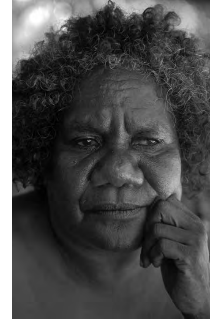
Above: Aboriginal woman in Australia.

The government has undertaken some initiatives to reduce social disparities for its indigenous population, such as the 2008 Closing