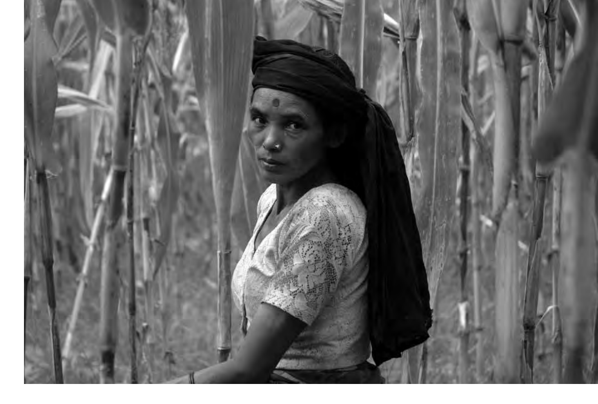
Above: Dalit farmer in Nepal.

April, the Supreme Court issued a notice to the central government and the Election Commission of India, advising that there should be stronger regulations on the use of hate speech and incitement to violence by elected representatives. This request is complicated, however, by immunity provisions for parliamentarians, bestowing freedom of speech for anything said in parliament or in a court of law. Continued attacks on minorities also renewed calls in support of a draft anti-communal violence bill. Continuing on provisions made from a similar draft bill in 2011 that stalled in parliament, the new draft bill seeks to protect minorities against violent attacks and imposes duties on the central and state government to prevent and control violence. NGOs in Madhya Pradesh welcomed the bill, as there is no strong central law to protect minorities against violence, ensure reparations for victims or hold perpetrators, especially politicians, accountable for their role in violence. By December, the Prevention of Communal and Targeted Violence (Access to Justice and