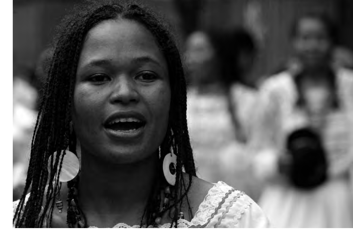
Above: An Afro-Bolivian woman dances during a carnival parade in Bolivia.

country, particularly through education. This included, in 2013, the launching of an academic network of racism studies and publications on related topics, such as the liberation struggles of indigenous peoples during colonial rule and the Afro-Bolivian community. In May, 14,000 students participated in a 'Plurinational Day against Racism and All Forms of Discrimination', while in September on-the-spot assessments were conducted in hundreds of schools across the country to assess the practical implementation of anti-discrimination legislation. There were also a number of other events and activities recognizing the cultural and historical contribution of indigenous peoples and minorities, including the construction of monuments commemorating female and male anti-colonial leaders, a campaign to revive the traditional Andean 'Christmas' and a celebration of Afro-Bolivian music. While these activities have been launched through the initiative of the state, there has been a progressively stronger uptake from civil society and local communities.