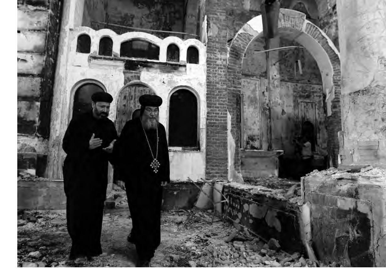
Above: Coptic Christians in Egypt walk around a damaged church. Louafi Larbi/REUTERS .

that Copts had agitated for Morsi's removal and participated actively in the subsequent crackdown. Morsi's Freedom and Justice Party posted a message on its Facebook page warning: 'Christians in Egypt ... deserve these attacks on churches and their institutions. For every action, [there is] a reaction.' As a result, the second half of the year saw repeated attacks against priests, abductions of Copts (including women and children) and frequent assaults on Coptic churches, houses and shops. Instances of local imams inciting violence against Coptic inhabitants were also reported. The violence peaked in August, following the dispersal of sitins held by pro-Morsi supporters. Mobs then attacked at least 42 churches, as well as Coptic houses, schools and associations, resulting in heavy damage. Reports of the death toll varied from four to seven people killed.