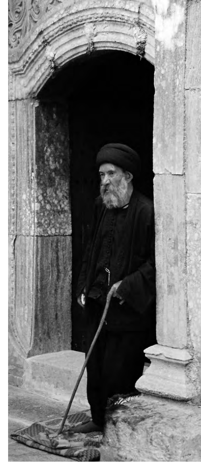
Above: Yezidi man in Iraq.

Another factor is that most minority groups are concentrated in strategic areas such as Baghdad or the oil-rich regions of Mosul, Kirkuk and the Ninewa Plains, where control is disputed between different factions. In these areas, religious and ethnic minorities have been pressured by Arab or Kurdish political groups. Yezidis and Kaka'i, two communities living mainly in the province of Ninewa and around Kirkuk respectively, reported having been subjected to threats and intimidation for their refusal to self-identify as Kurds. The